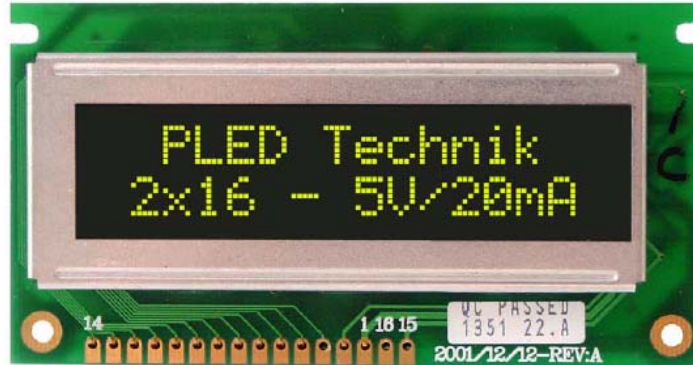
EA 8162-XLG: 84x44x9,4mm